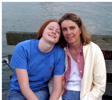
Belles of Basel