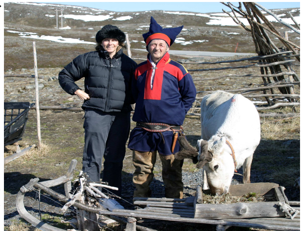
Adele with friends in Norway

stituting and traveling is too much fun to give up. So, now you know which way I'm leaning. I am still taking an occasional art class and painting, be it watercolors or pastels.