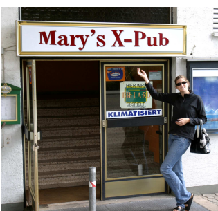
Even in Germany, she's famous