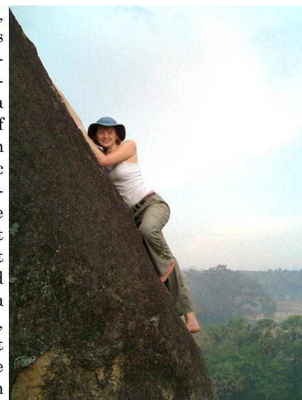
Rock Climbing in Sri Lanka

It was a bumpy ride to Kandy, as the roads hadn't been repaved since the British left in 1948. I learned some Sinhala, about living in the upper crust of a society, and how to cross streets when drivers don't follow any traffic laws.