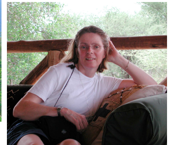
Relaxing before dinner.