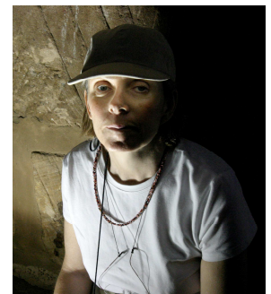
The ghost of Nefertiti still haunts Egyptian tombs!