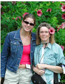
Caribbean Flowers December, 2003—Virgin Islands