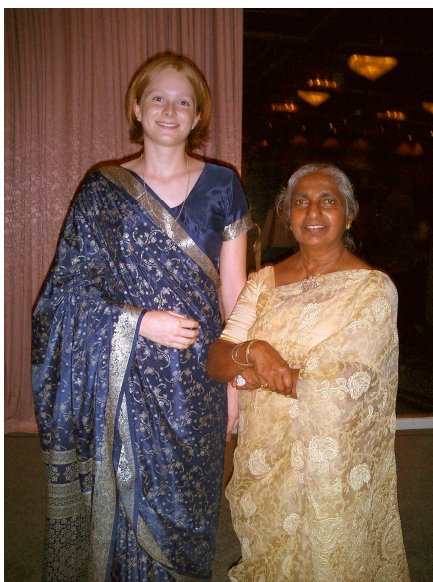
In Sri Lanka with her host mother

Shouldn't the advent of my 21 st birthday be a turning point in my life? Most of my friends, my sister included, are jealous of the new found privileges of this age group. I'm still a dependent on my tax return, I don't drink much, and the highlights of my year occurred in countries where 21 is the same as 19 and 40.